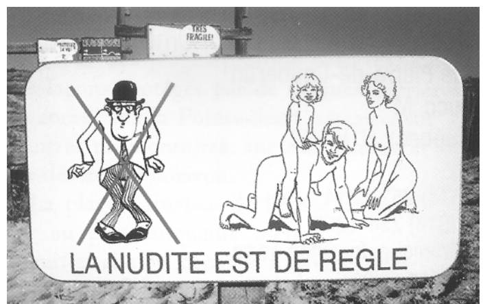
NUDITY IS THE RULE Sign at Oka naturist beach in Québec

As reported in The Daily Journal - January 3, 2006 www.thedailyjournalonline.com