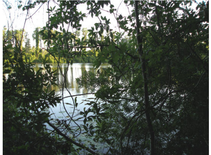
Two views of Heron Lake from Lake Como's secluded Gerald & Thekla wetland trail

A version of this article first appeared in The Naturist Society's N Magazine, Autumn 2008, issue 28-1