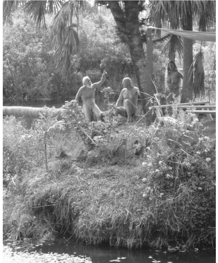
The Island at Sunsport Gardens

Clothed only with the sun and the gentle breeze, and desiring nothing more for completion, a camper emerges from his tent at Sunsport and watches the play of otters in the pond; sky-clad, in the raiment of nature or of nature’s God or gods, a kayaker skirts the wetland shore along Como’s Big Moss Lake, warming her skin like the shy, lurking alligators in the sun’s new-born morning radiance; quiet bird-calls gently waken the camper in Sunnier’s palm forest, in lieu of the insistent beep of the digital alarm clock, once carefully packed but now thankfully forgotten in favor of nature’s gentler, more organic rhythms. These are moments that cannot ever be forgotten; places that must be preserved for future generations. ☀